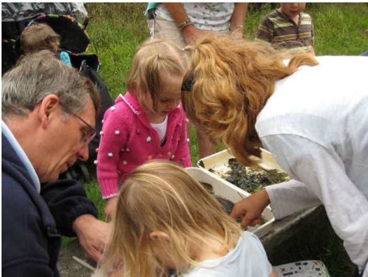
A good catch