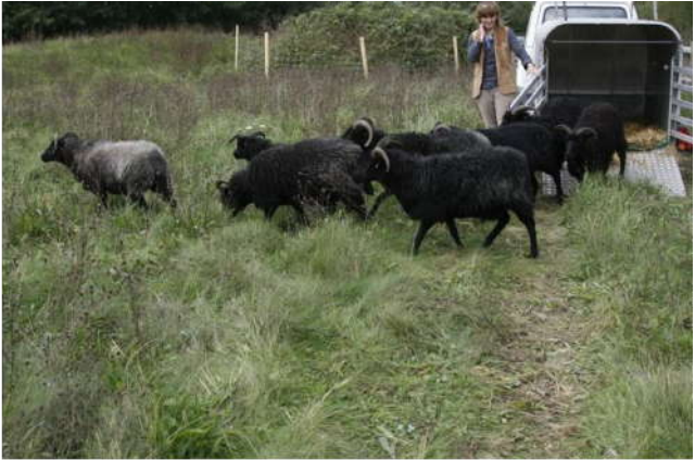
The moment of arrival

was chosen as they are renowned for browsing a mixture of foliage from grasses to bramble! We also think that the sheep are a great visitor attraction that will brighten even the quietest day on the reserve! Unfortunately the Mill Meadow has had to be fenced along the mill pond side, which has been met with mixed emotions, however the sheep were likely to find a way across to the Swan Is-