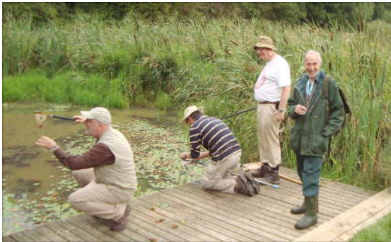
And now the grown-ups(?) turn