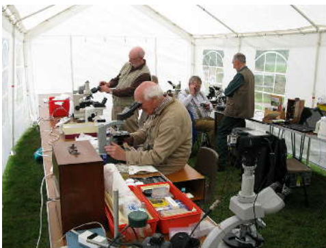
In the marquee