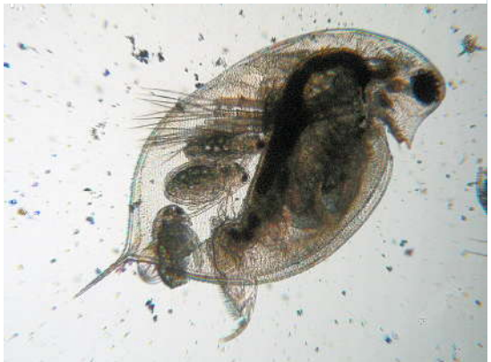
Daphnia with young in the brood pouch