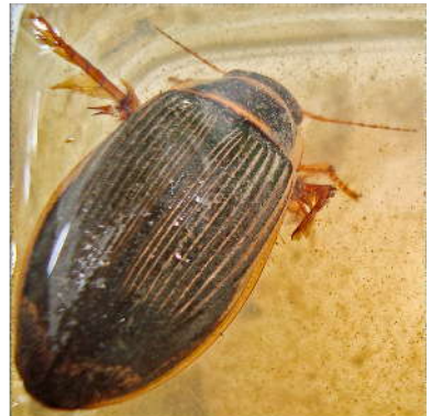
Great Diving Beetle (female)