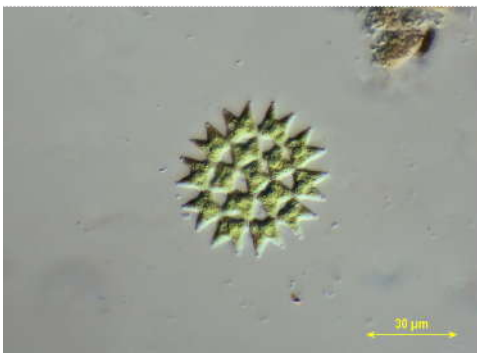
Pediatrum, colonial algae