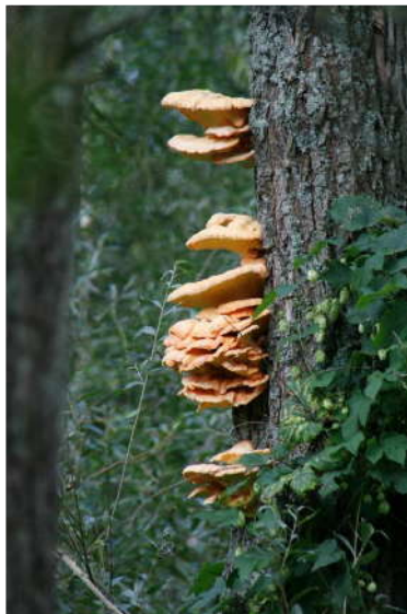
Chicken of the wood