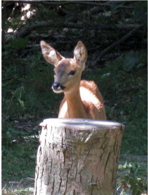
Hungry roe deer